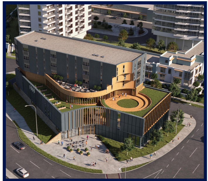
Conceptual rendering, 3404 Bow Trail SW, Calgary

This 55,000 SF of developed space is purpose-designed to reflect the traditional territories of the Blackfoot Confederacy and the nations who make their homes in the Treaty-7 region of Southern Alberta.