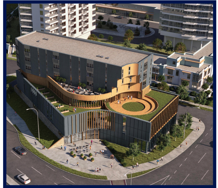
Conceptual rendering, 3404 Bow Trail SW, Calgary

This 55,000 SF of developed space is purpose-designed to reflect the traditional territories of the Blackfoot Confederacy and the nations who make their homes in the Treaty-7 region of Southern Alberta.